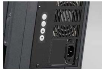
400W PS/2, Optional Redundant Power Supply