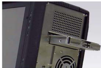
Integrated 3.5" HDD