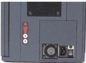
400W power supply 110/220V 50/60Hz