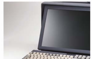
Tiltable high resolution LCD display