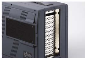
Up to 12 slot expansion capability