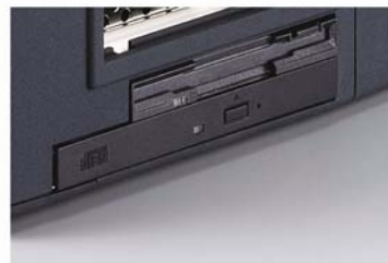
Integrated FDD and optical drive bays